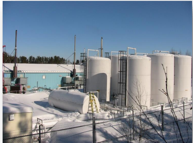
Fuel Tank Farm at Kingfisher Lake First Nation

The Canadian Council for Aboriginal Business has given Hydro One a Silver Progressive Aboriginal Relations (PAR) rating: